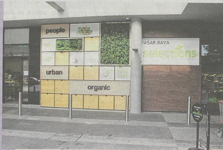
The entrance on street level.

□ Story courtesy of Henry Butcher Malaysia