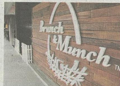
Egg-celence in a shell